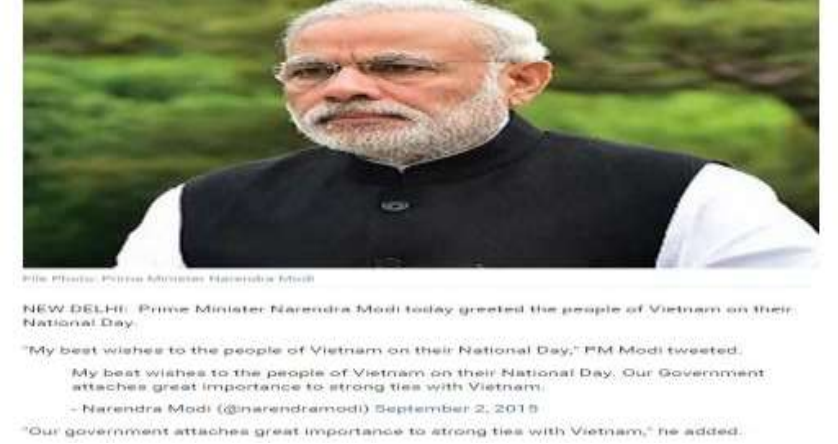
Figure 2: News Text Images using for generation the caption