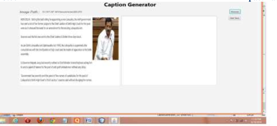
Figure 5: Apply OCR for extracting Text

The image can be selected then apply the OCR to text can be extract here the text can helps to caption generator for related news images.