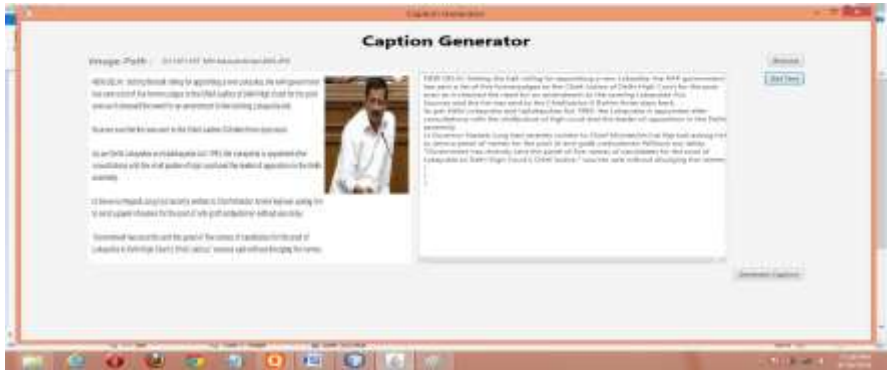
Figure 6: Text Extraction for news text image

The image can be selected then apply the OCR to text can be extract here the text can helps to caption generator for related news images.